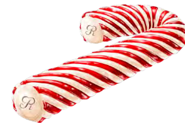
CANDY CANE CHRISTMAS LOG AND ASSORTED SHORTBREAD LOG